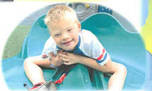
"Don't judge a disability by its visibility."